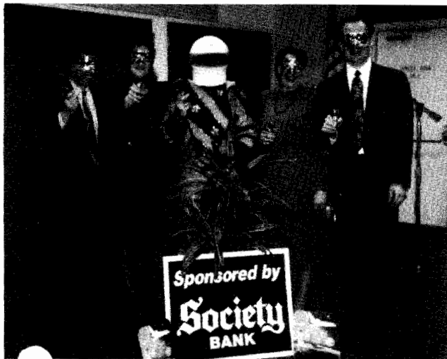
The Aliens have Landed during the Kickoff in Elkhart.

In addition to the Personal Credit Picture, credit worthy clients will be given a waiver of the closing costs on Purchase Planner and Home Equity Loans, as well as a waiver of the first year annual fee on approved Society Mastercards or Visa's.