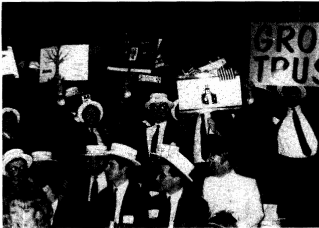
Cheering and waving their "political" signs, members of the Indianapolis Trust "Delegation" show their Society spirit.