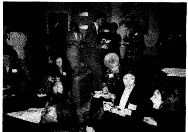
Central Region Crew Members refueled after receiving instructions for their mission. It was definitely not a hostile environment.